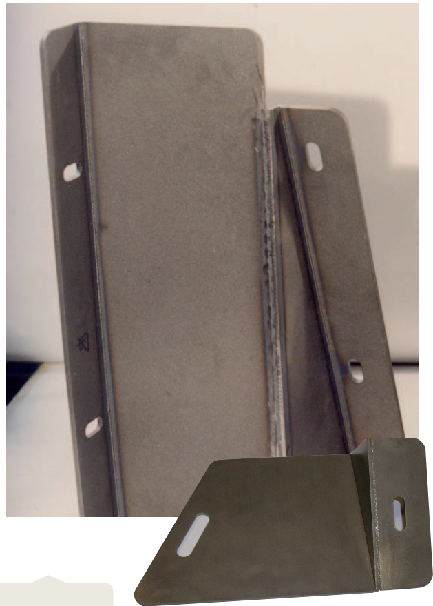
Laser cut and welded parts Mars® 240 - 4,7 mm (.19")

Please contact us for any information (see item parts-kits option)